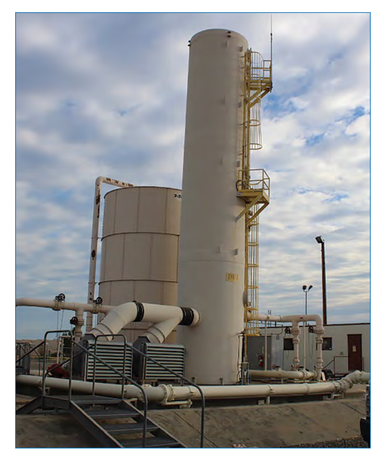
Air Force Groundwater Treatment Plant will be relocated north of its present site in 2023. Relocation will enable access to clean up contaminated soils beneath the area, and the relocated plant will operate more efficiently with new equipment and technology.

The relocated plant will have new equipment, allowing it to run more efficiently by using less electricity. Drinking water at McClellan is supplied by local purveyors upstream and is not impacted by groundwater in this area. New wells are prevented to use the groundwater beneath McClellan as a drinking water supply.