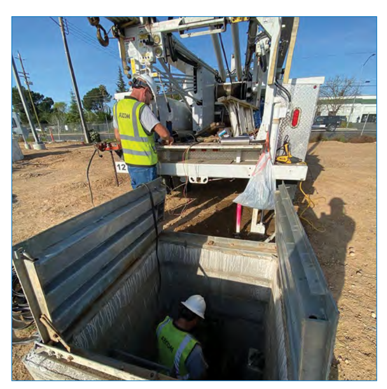
More than 70 extraction wells located on the former base assist with ground-water cleanup, removing water deep below the surface for treatment. Although this water is not used for drinking, it is remediated to ensure long term protection of public health and the environment. Air Force contractors perform important maintenance at these extraction sites throughout McClellan.

AFCEC environmental contractors have opened sites that were winterized last fall such as the Consolidation Unit by removing protective tarps and making inspections, and accepting soils from cleanup sites around McClellan. The CU provides a large, on-site, permanent disposal facility for excavated soils. It is open for soil projects from April to October. The cleanup team's work includes screening, sampling and scanning the soil prior to placement into the CU.