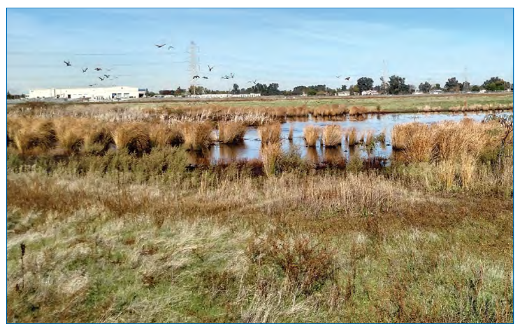
The West Nature Area is an established conservation area that encompasses approximately 222 acres along the northwest side of McClellan and includes Magpie and Don Julio creeks.

Over 95% of the existing buildings are occupied with new construction projects occurring throughout McClellan.